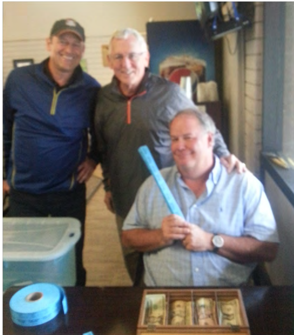
Please Buy Tickets