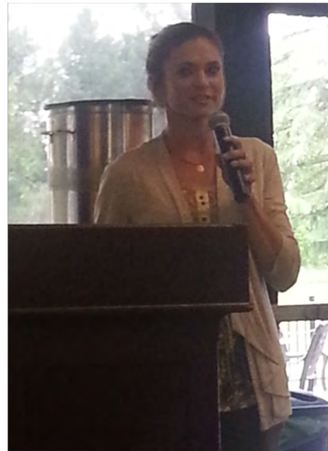
1st Tee Director