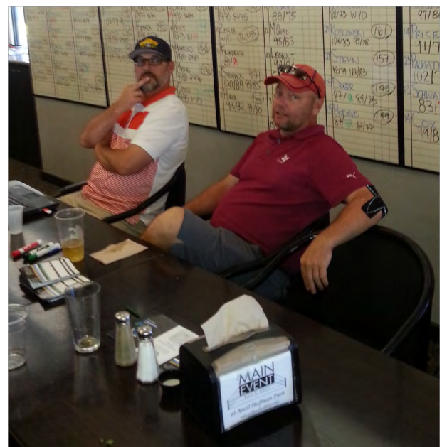
Scoring Table at the President's Cup